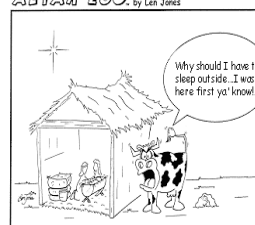
The first reported case of 'Mad Cow' disease.