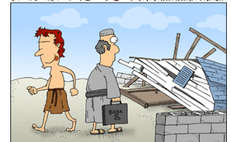
AND THEN THE FOOLISH MAN SIMPLY FORECLOSED AND WALKED AWAY